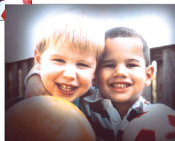
A scene as it might be viewed by a person with glaucoma.